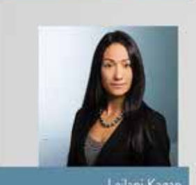
Thompson Dorfman Sweatman LLF