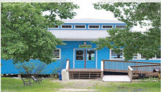
A generous grant from the JFM will enhance Camp Massad’s “Chadar Ochel” (dining hall).