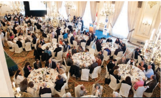
Attendees of the Women’s Endowment Fund luncheon.