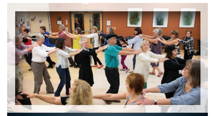
KlezFest attendees practise traditional European Jewish dances.

Since 1995, the JFM's Special Grants initiative has been making Jewish life in Winnipeg more, well, special.