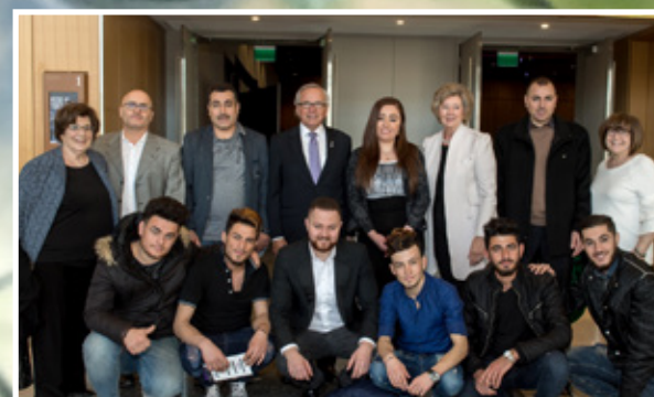
Her Honour, The Honourable Janice Filmon, Lieutenant Governor of Manitoba, and His Honour, The Honourable Gary Filmon and members of the Operation Ezra Working Committee alongside Yazidi Refugees brought to Winnipeg through Operation Ezra